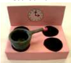
Keep on Cooking!

American Girl - Pets: These doll-sized pets are full of personality! We will use armatures and Model Magic clay to create these cute pooches. We'll even give each pet its own removable collar and leash!