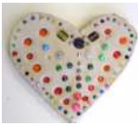
Magical Mud Mosaics

Magical Mud Mosaics: Clay by itself makes great art, but adding beads, tiles and sequins makes it even better! Air-dry clay will be used to create fun and funky mosaics.