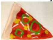
Pop Art Pizza

Lego Loco: Use your awesome Lego building skills to create amazing Lego art! Mosaics, sculptures, race cars or Lego mural are just a few of the options.