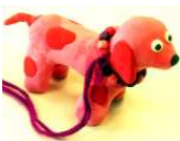
American Girl- Pets

Video Gamer: Want to channel your child's love of video games into a creative, fun birthday party? Have the kids put down the controller and come create their own 3-D racecourse in the style of the Mario Kart video game.