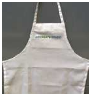
One size fits all