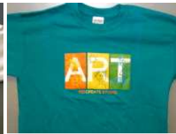
Size: Youth Small-Youth Large